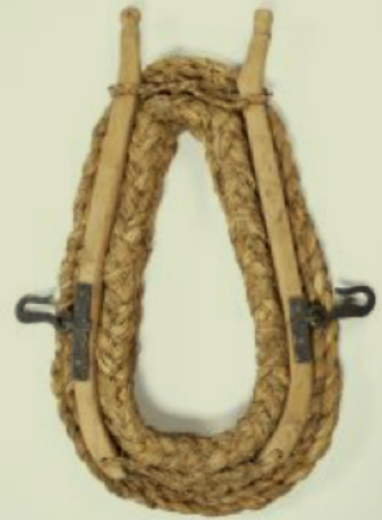
Coiléar capaill luachair agus amaí adhmaid. Curraghinalt, Co Thír Eoghain Bailiúchán AMÉ

Creidtear go coitinne gur ghlac coiléir leathair, a bhí níos buaine, ionad an chleachtais de choiléir thuí a dhéanamh.