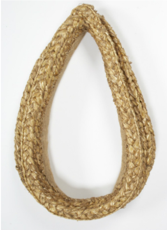
Horse collar, Larganboy West, Bekan, Co Mayo