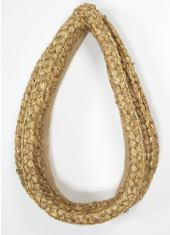
Coiléar Capaill An Leargain Bhuí Thiar, Béalán, Co Mhaigh Eo