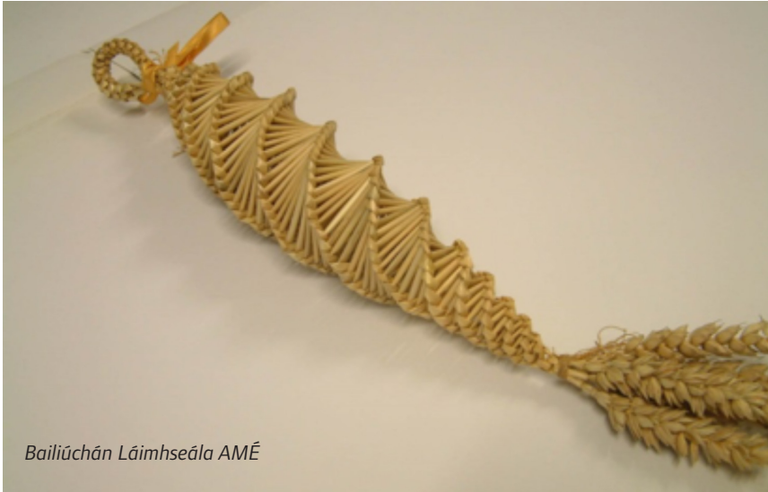
Bailiúchán Láimhseála AMÉ