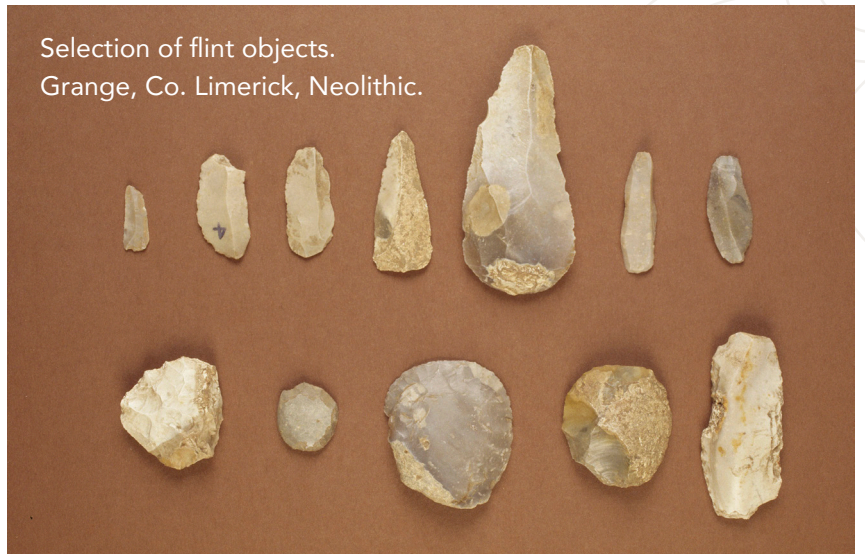
Selection of flint objects. Grange, Co. Limerick, Neolithic.

At the Museum's Prehistoric Ireland Exhibition you can see some decorated megalithic stones from Ireland dating to the Stone Age and Bronze Age