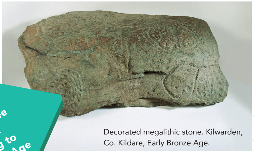
Decorated megalithic stone. Kilwarden, Co. Kildare, Early Bronze Age.