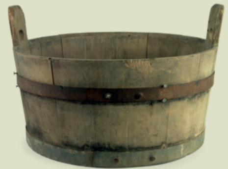
Washing Tub NMI Collection

Water often had to be carried some distance from a well or pump. Efforts were made to store rainwater and some rural communities used streams for washing. In some areas, this strenuous work was still in use well into the 20th century.