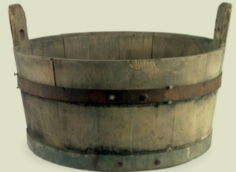
Tobán Níocháin

Is minic a bhí riachtanas ann uisce a iompar píosa maith ó thobar nó ó chaidéal chuig an teach. Rinneadh iarrachtaí uisce báistí a stóráil agus bhain roinnt pobal tuaithe úsáid as sruthanna le haghaidh níocháin. I limistéir ar leith, bhí an dianobair seo fós in úsáid fada isteach sa 20ú haois.