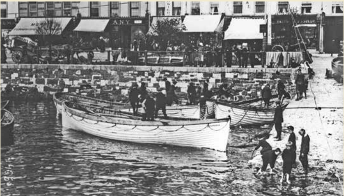
Lusitania life boats bringing rescued passengers to the shore in Cobh, Co. Cork Báid tarrthála an Lusitania ag iompar paisinéirí tarrtháilte go Cóbh, Co. Chorcaí

German U-boats prowled the Irish Sea sinking merchant vessels. The torpedoing of the transatlantic liner Lusitania in May 1915 off Kinsale, Co. Cork, not only killed 1,200 civilians but also provided invaluable propaganda for the British, who wanted America to join the war.