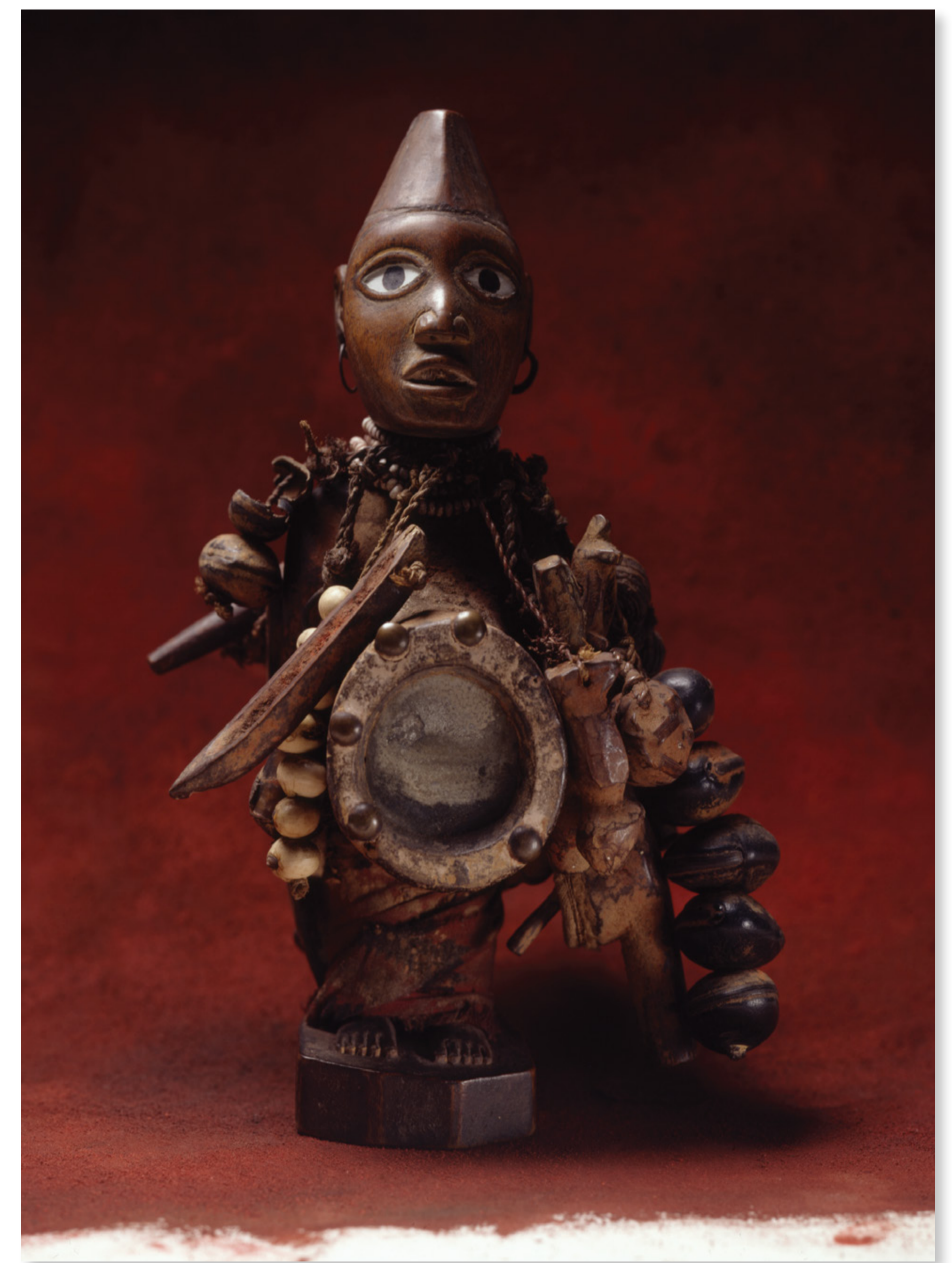
Nkisi nó fíor chumhachta Massabe, Cabinda, Angóla