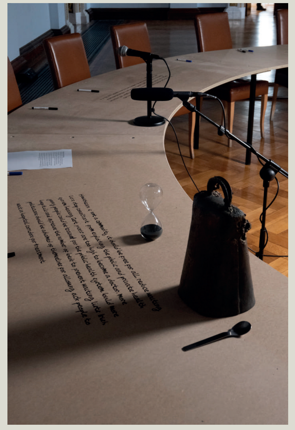
Young People's Assembly 2023