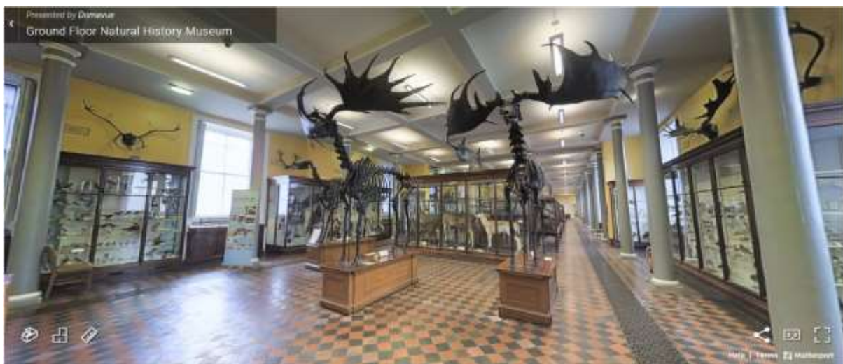
Image 1: 3D Virtual Visit – View upon launching Ground Floor – Irish Fauna