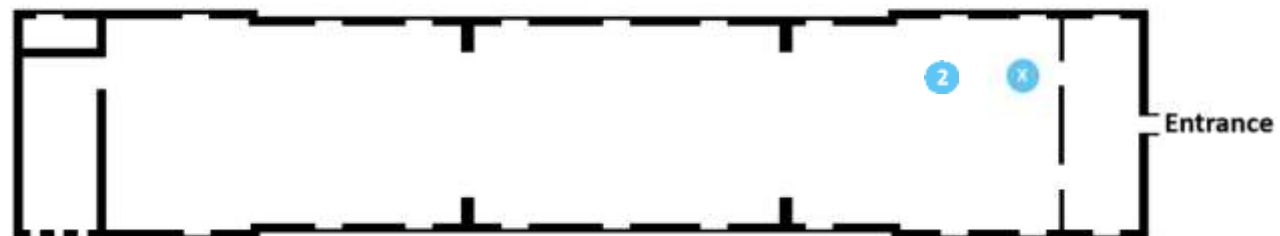
Ground Floor - Irish Fauna