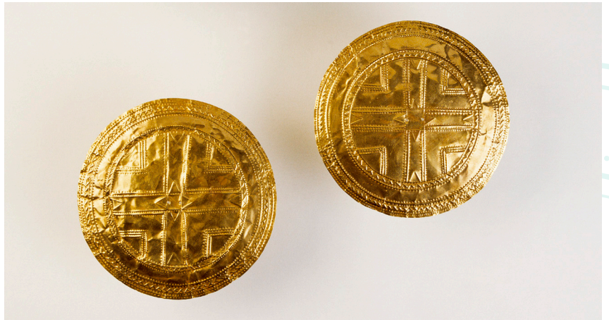
Pair of Sun Discs. Tedavnet, Co. Monaghan, 2200-1800 BC

Sun Discs are circular discs that are made from gold and they date to the Early Bronze Age. There have been many examples found in Ireland. Sun Discs are often found in pairs, which are almost identical to each other. At the centre of each of the discs there are two holes, just like the centre of a button, and it is thought that these were used to stitch the Sun Discs to clothing.