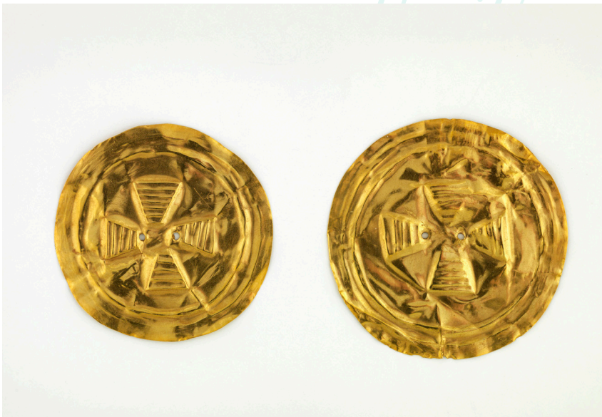
Pair of Sun Discs. Co. Roscommon, 2200-1800 BC

They are called Sun Discs because it is thought that they were made to look like the sun. Their circular shape shows how the sun is seen in the sky, and the use of gold represents the colour of the sun. A lot of Sun Discs are decorated with crosses, circles, or lines, coming from the centre. It is thought that this decoration may represent the rays of light as they come out of the sun.