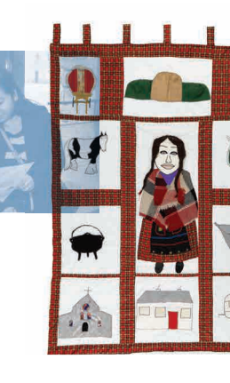
Ard-Mhúsaem na hÉireann / National Museum of Ireland