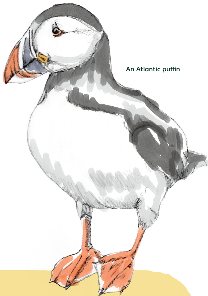
An Atlantic puffin