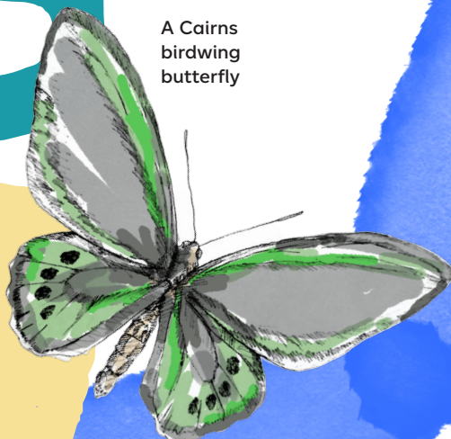
A Cairns birdwing butterfly

Name one other animal in the Dead Zoo Lab that you like: