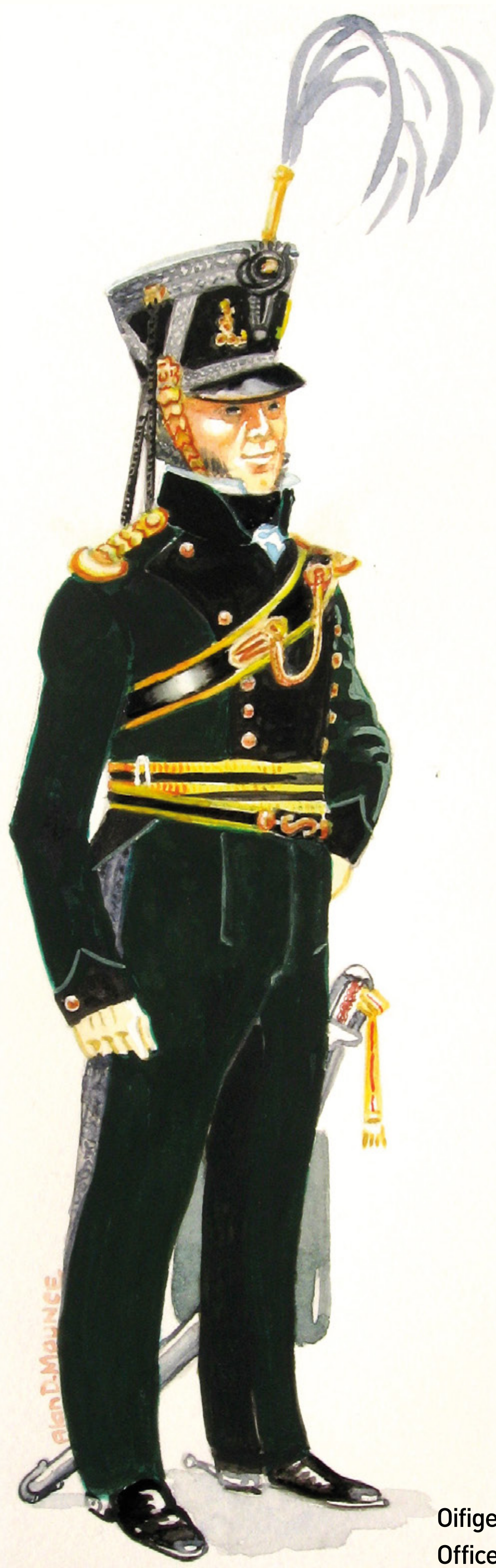
Oifigeach, Constáblacht Chontae, c.1822 Officer, County Constabulary, c.1822