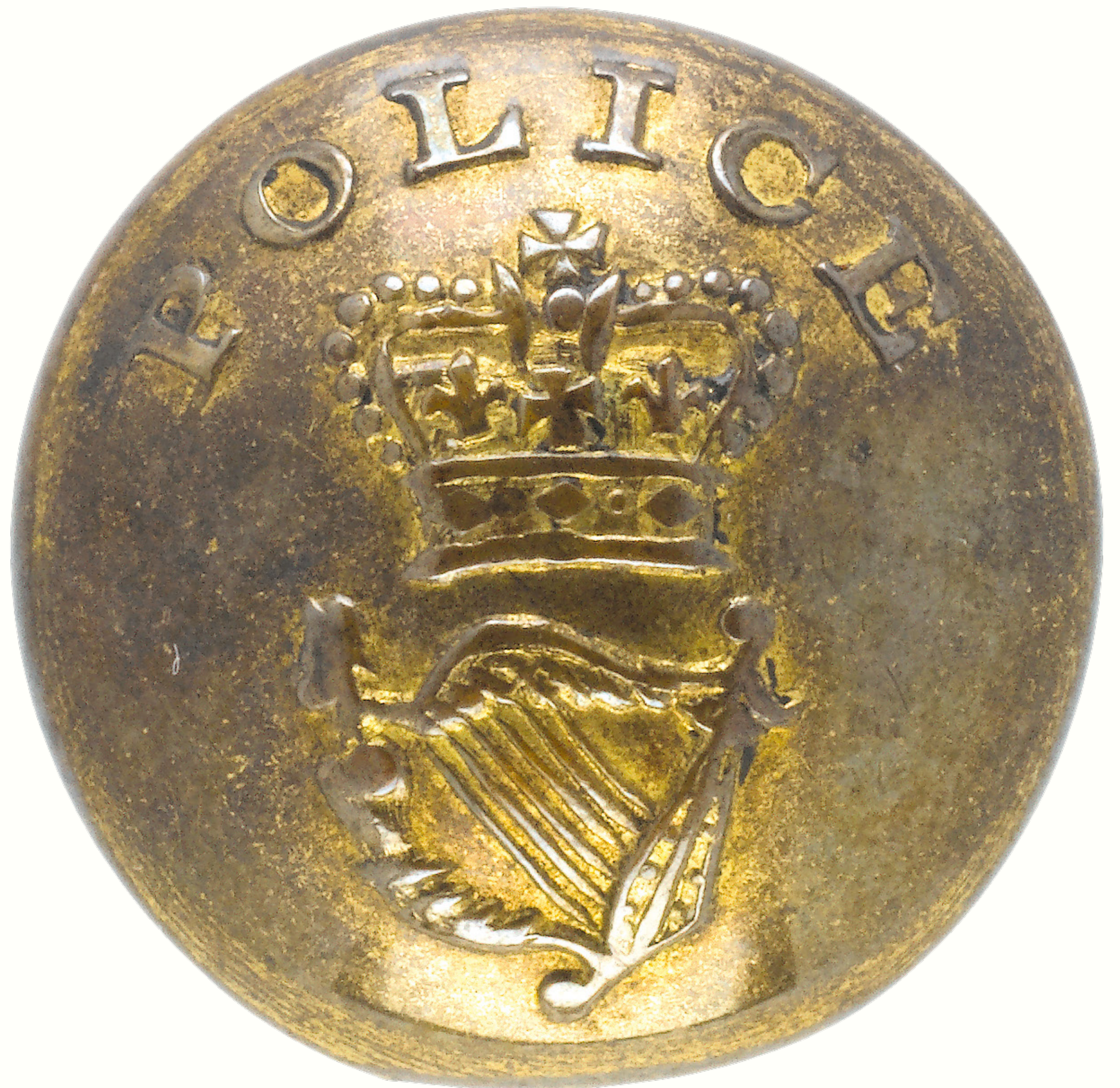
Cnaipe Constáblachta Contae, c.1822 County Constabulary button, c.1822