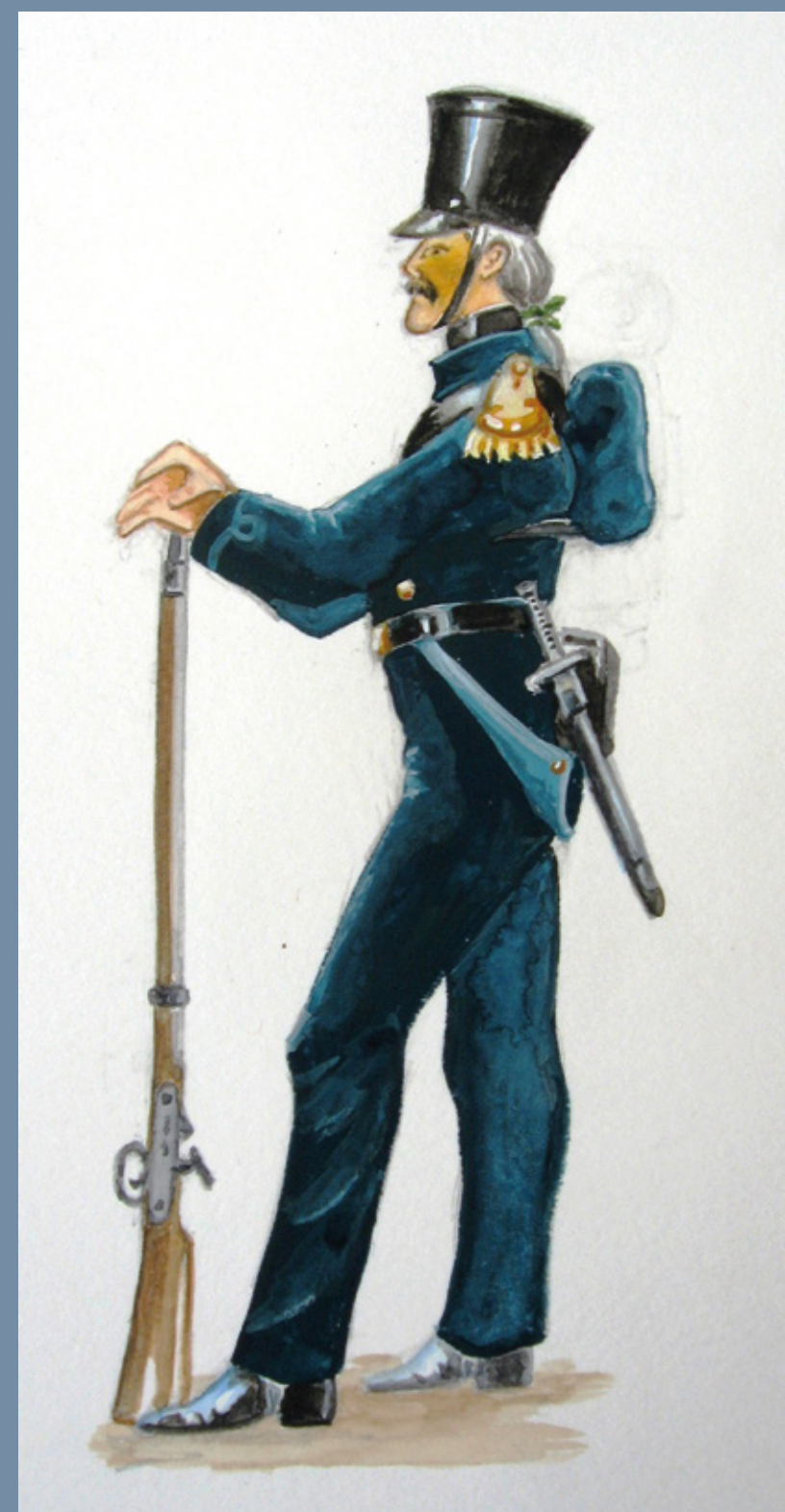
Fo-Chonstábla, Constáblacht Chontae, 1822-36 Sub Constable, County Constabulary, 1822-36

By the early 1800s, the Irish authorities were convinced that traditional policing measures were no longer suited to maintaining the peace.