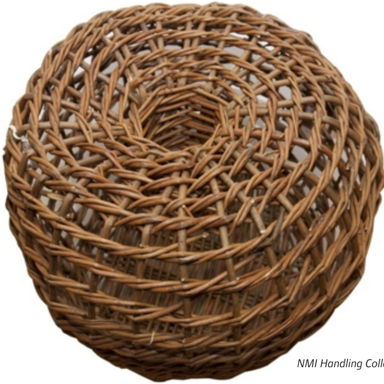
NMI Handling Collection