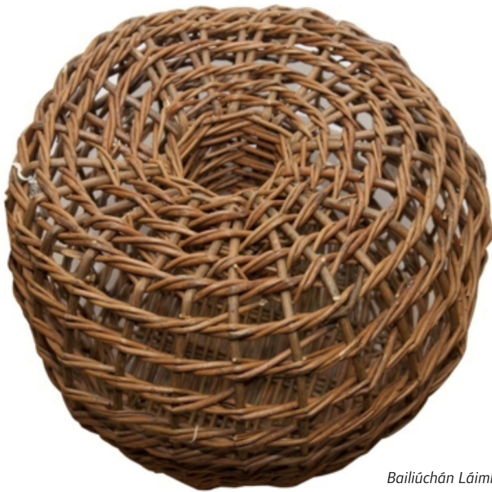
Bailiúchán Láimhseála AMÉ