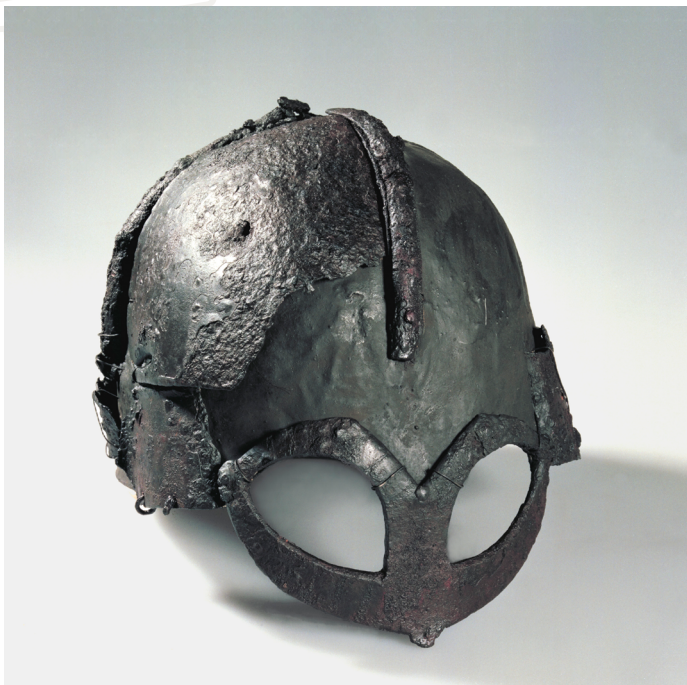
Viking Helmet, Gjermundbu, Norway Viking Age, c. 10th Century CC BY-SA 4.0, Museum of Cultural History, University of Oslo. Image by: Holst, Ove.

There has been very little archaeological evidence for Vikings wearing helmets at all! Only one complete helmet has ever been found and that was found at Gjermundbu in Norway. This dates to the 10th century and is around 1000 years old.