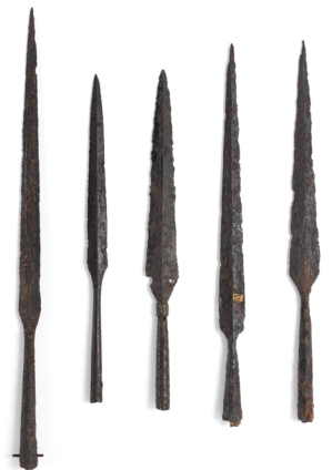
Viking Sword. Ballinderry, Co. Offaly, 9th century. Selection of Iron Spearheads. Viking Age.