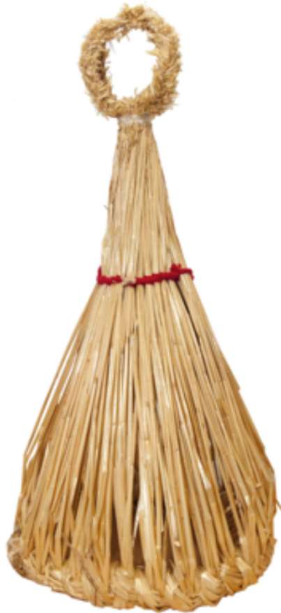
Bailiúchán Láimhseála AMÉ