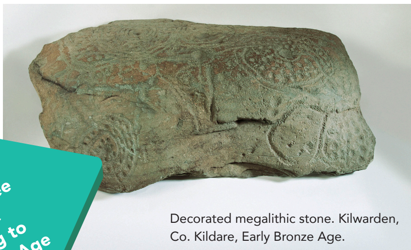
Decorated megalithic stone. Kilwarden, Co. Kildare, Early Bronze Age.