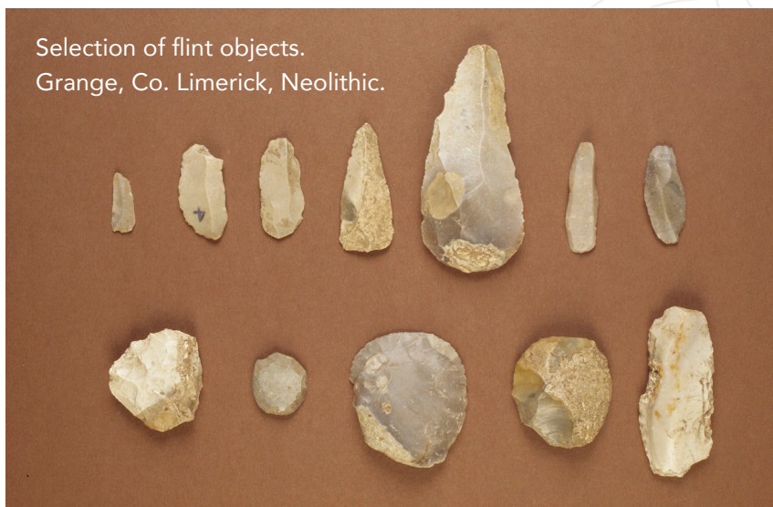
Selection of flint objects. Grange, Co. Limerick, Neolithic.

At the Museum's Prehistoric Ireland Exhibition you can see some decorated megalithic stones from Ireland dating to the Stone Age and Bronze Age