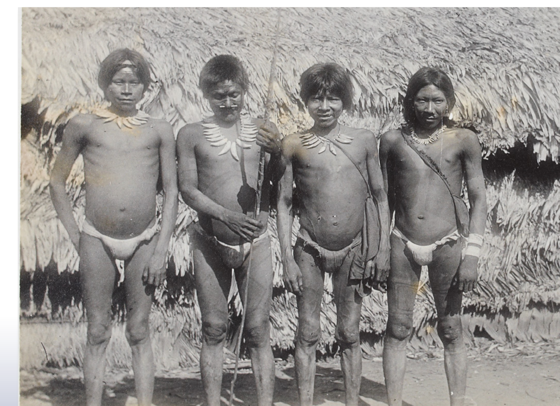
Grúpa d'fhir óga ó réigiún Abhann Putumayo Group of young men from the Putumayo River region