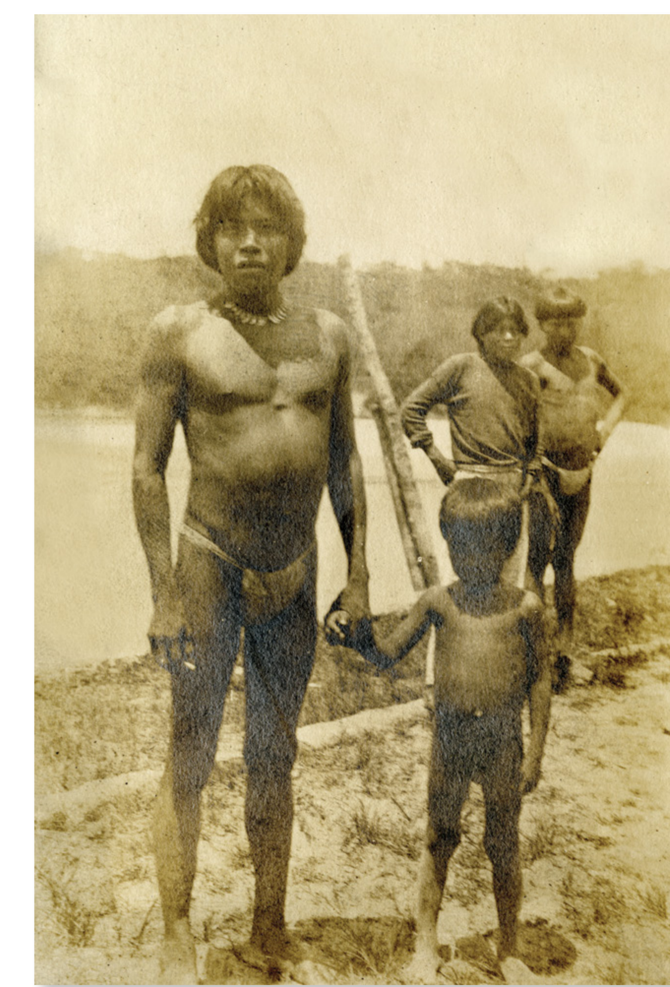
Fear ag caitheamh fono (bristéán) le buachall, réigiún Abhann Putumayo Man wearing a fono (baincloth) with a boy, Putumayo River region

His Congo and Putumayo reports brought global attention to the atrocities. They demonstrate his talent as an observer and investigator. In 1911 he was awarded a knighthood in recognition of his work. He grew increasingly appalled with the establishment's treatment of indigenous peoples. Over time he noticed similarities between the destruction of indigenous culture by colonisation and the Irish situation.