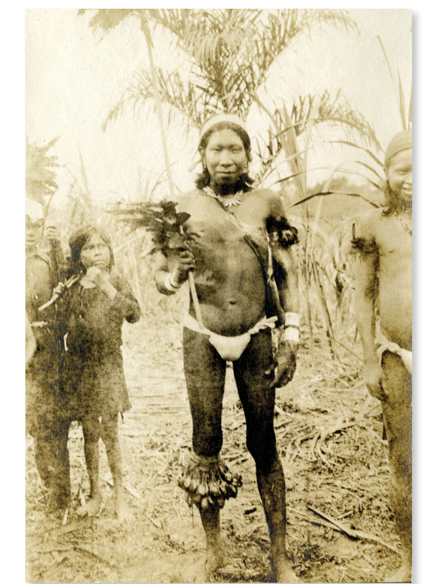
Fear a bhfuil glogar rince timpeall ar a chos dheas, réigiún Abhann Putumayo Man with a dance rattle around his right leg, Putumayo River region