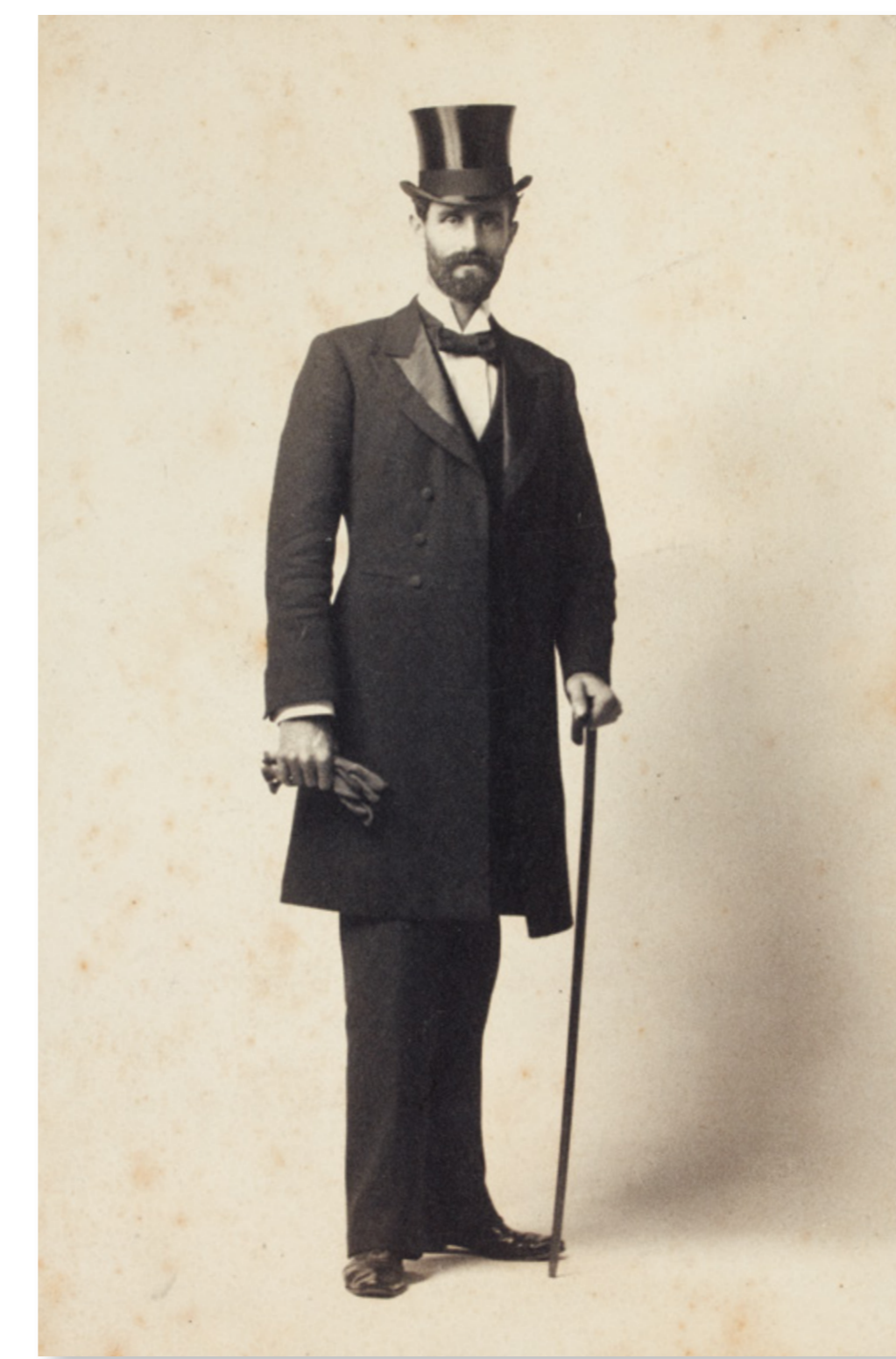
Ruairí Mac Easmainn i bhfeisteas fairmiúil Roger Casement in formal dress