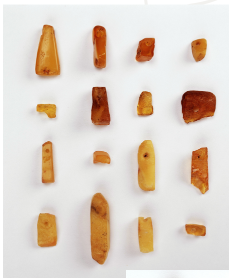
Selection of amber pendants. Dublin, Viking Age.

In Norse Mythology, Odin is the most powerful of all the Viking gods. He is the god of knowledge, war, and victory. Odin rules from Asgard, in a silver tower, and has two ravens that fly all over the world. When they return, they sit on Odin's shoulders and tell him everything that they have seen and heard. They are called Hugin and Munin. Hugin represents 'memory' and Munin represents 'thought'.