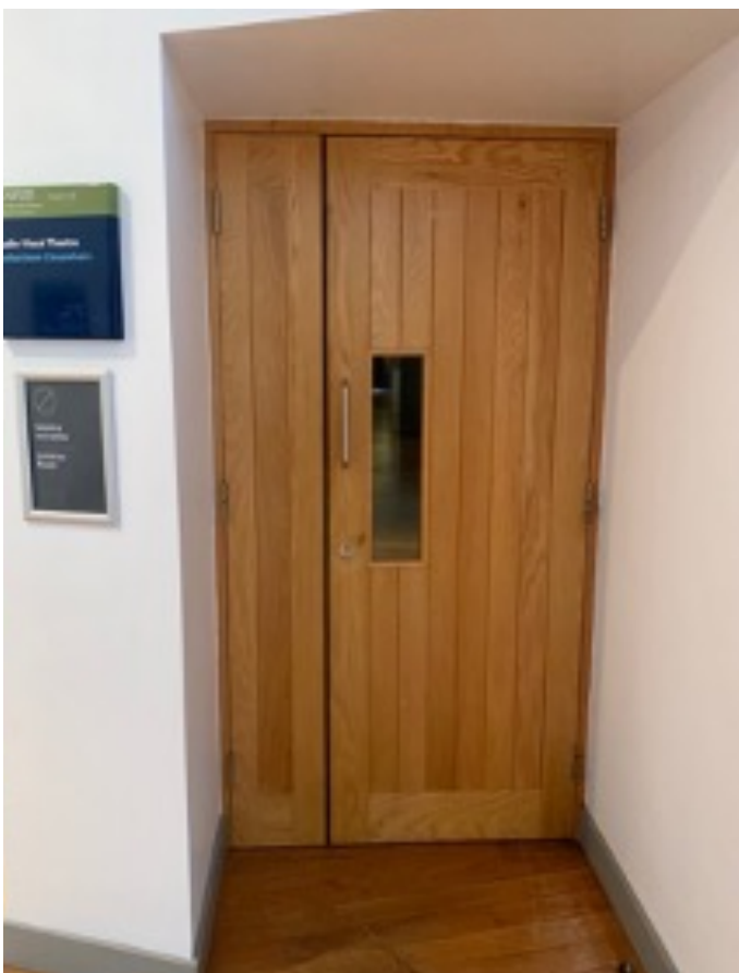
There is also an Audio-Visual room where you can watch a video about the Museum. It is dark in this room and the video has a soundtrack.