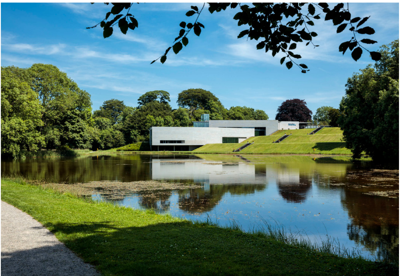
People come to Turlough Park to visit the Museum and to walk around the grounds.