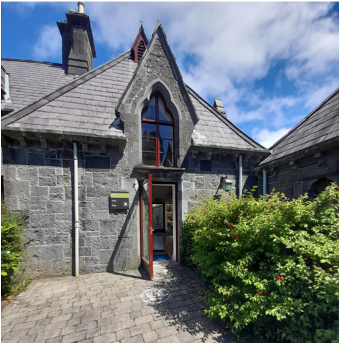
To the right of the main House is the Museum Shop.