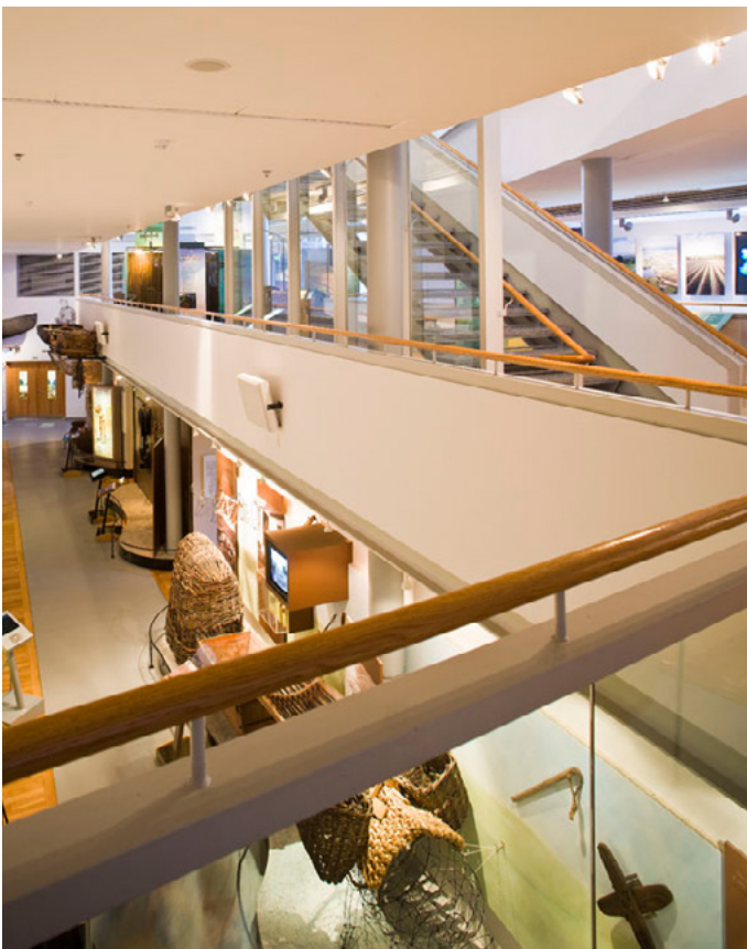
This is Level A, the same level where you walked in.

The four floors of the Museum have objects on display. If one part of the Museum is busy you can easily go to a different floor where there are less people.