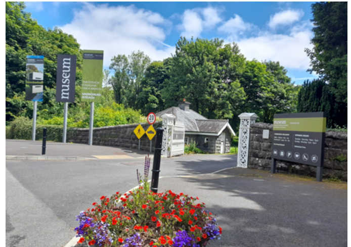
The Museum is on the grounds of Turlough Park. This is the main entrance gate.

Museums keep and display objects that tell us about people's lives. The National Museum of Ireland - Country Life displays objects that were made and used in everyday life in the past.