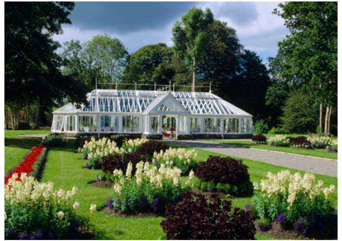
Some people might bring a picnic to enjoy if the weather is fine.