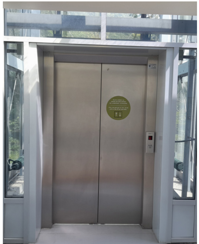
You can go down the stairs or take the lift to the lower levels. They are called Level B, Level C, and Level D.