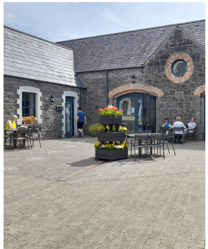
The archway will take you to the Museum Café. You can sit outside if the weather is fine. There are also tables inside.