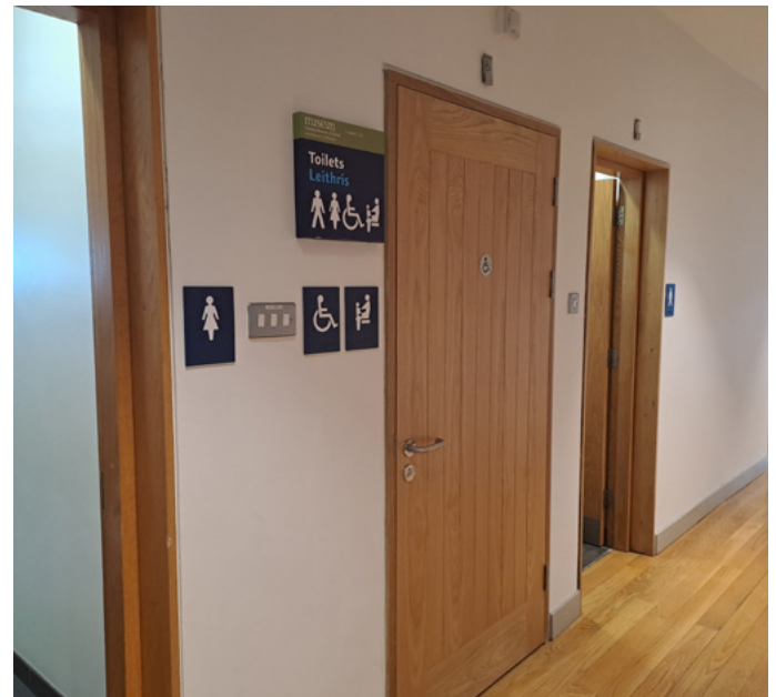
To the right of the Reception Desk are double doors that lead to the public toilets.